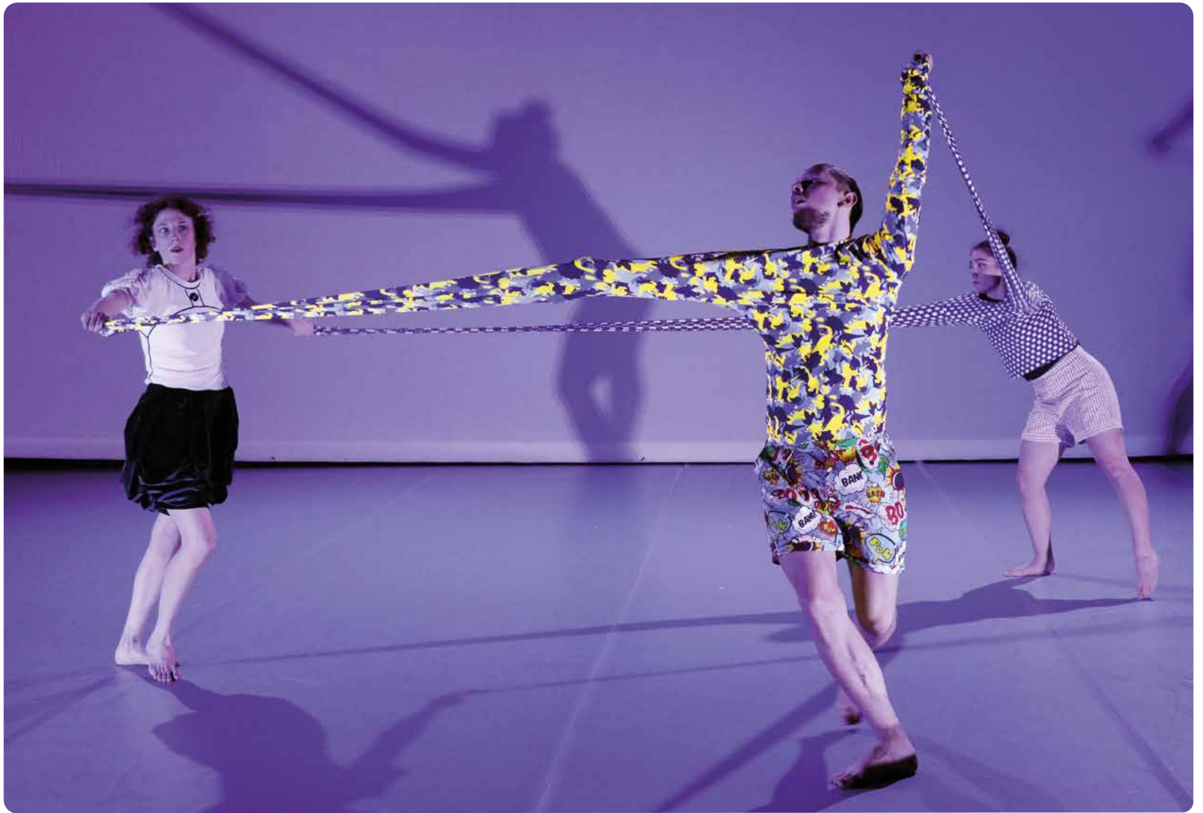
Time is Running