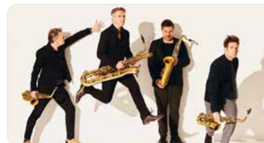
Artvark Saxophone Quartet musicians